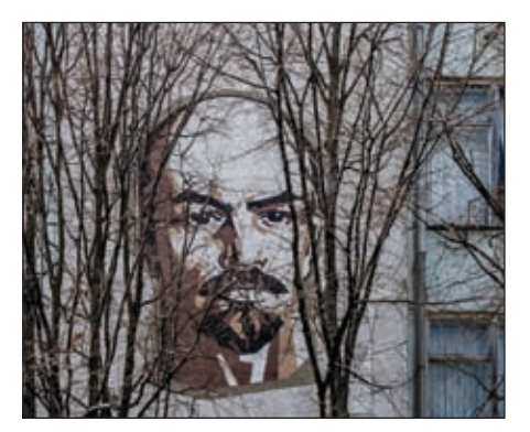
Figure 6. The former factory "L. I. Lenin", the 1960s. Bălţi, Moldova (BACU Association Photo department, circa 2017)

Under such circumstances, the legislation on socialist heritage protection needs to be reviewed, because, at least in Romania and the Republic of Moldova, it is not serving its purpose. We are interested in preparing a draft bill that would help preserve these architectural objects and the specific atmosphere it created. The bill will have the object of preserving built architectural heritage, setting directions for its revitalization and supporting projects for the classification and conservation of buildings in a bad state of decay.