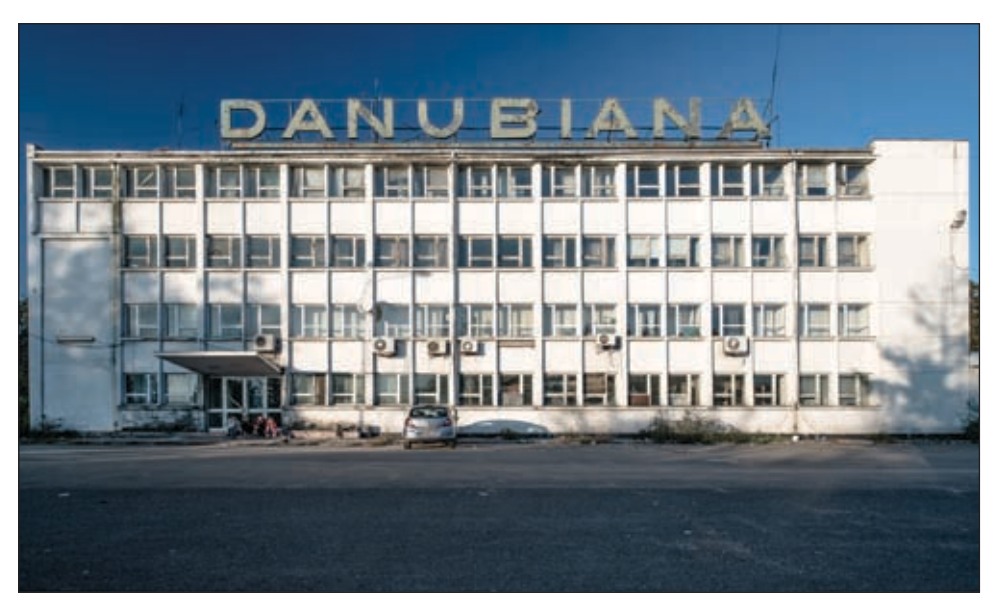
Figure 4. Danubiana Industrial Complex in Popeşti-Leordeni, Romania (BACU Association Photo department. circa 2015)

The Postal Palace, 2 Octavian Petrovici Street, Cluj-Napoca, Romania