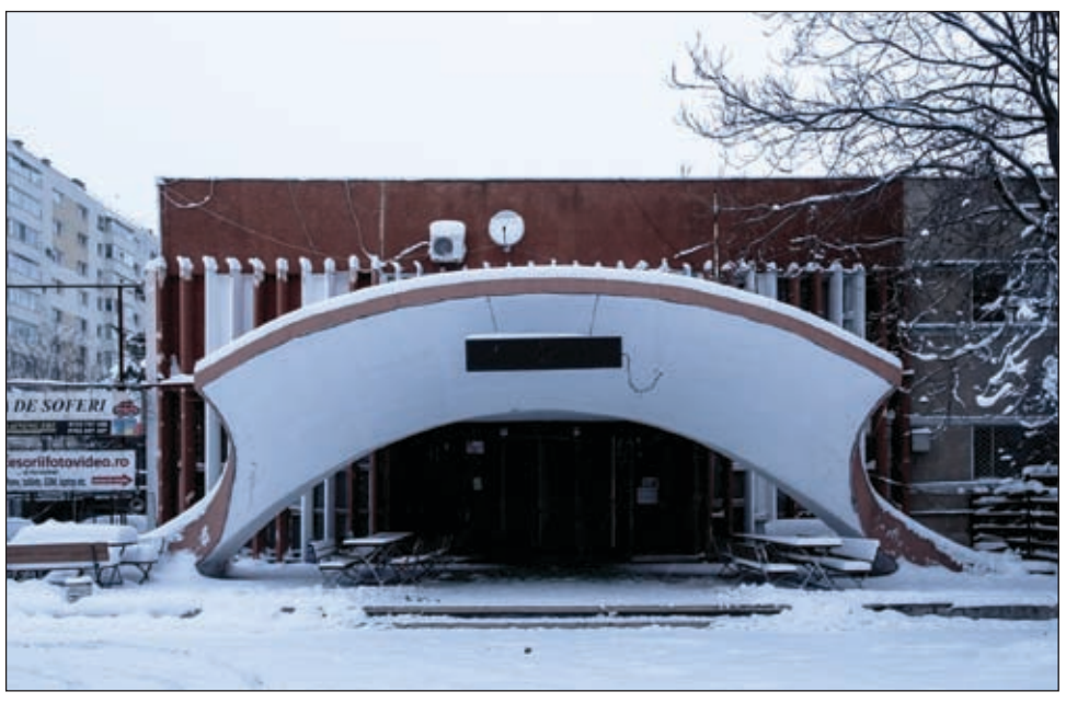
Figure 3. "Alexandru Sahia" Woollen Mill in Bucharest, Romania (BACU Association Photo department. circa 2017)