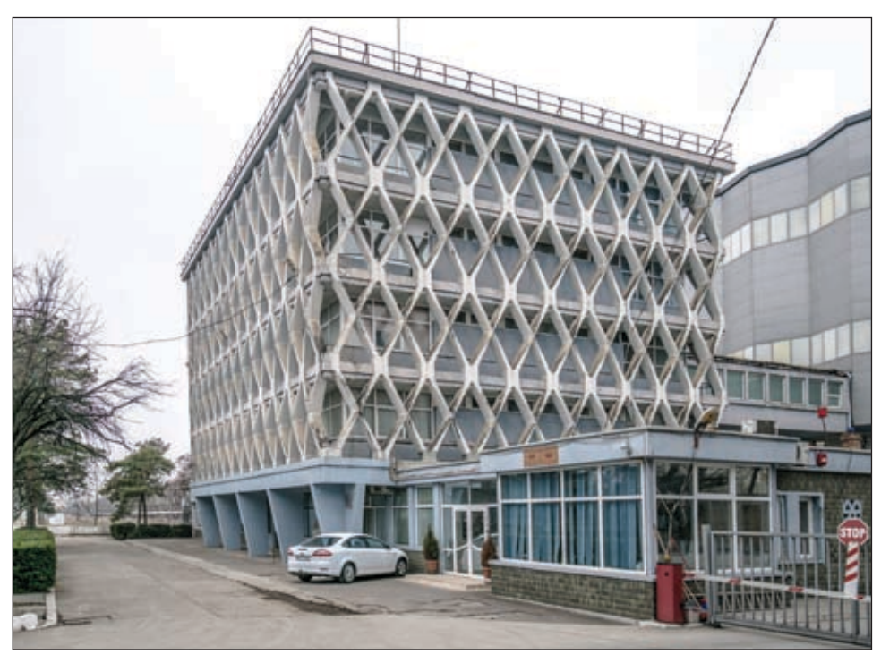
Figure 2. Sugar Factory in Buzau, Romania