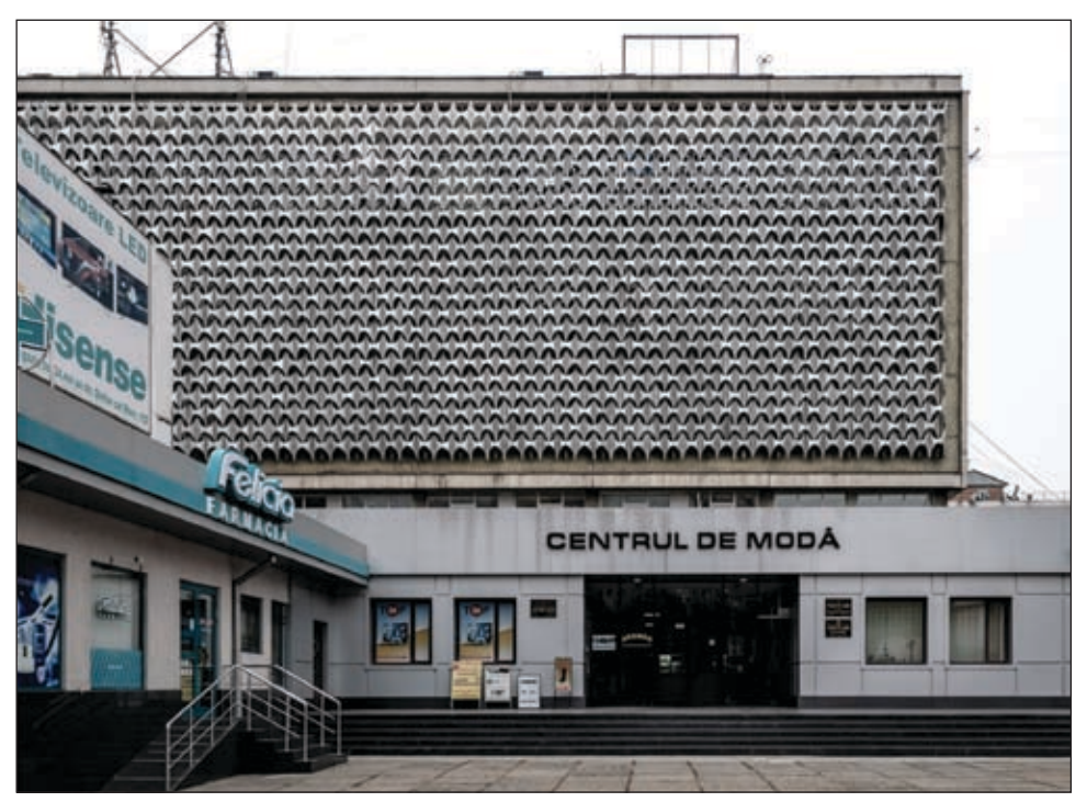
Figure 6. The Fashion House in Chişinău, Moldova (BACU Association Photo department. circa 2017)

I will briefly introduce two initiatives that follow a series of actions to preserve the heritage of the socialist period.