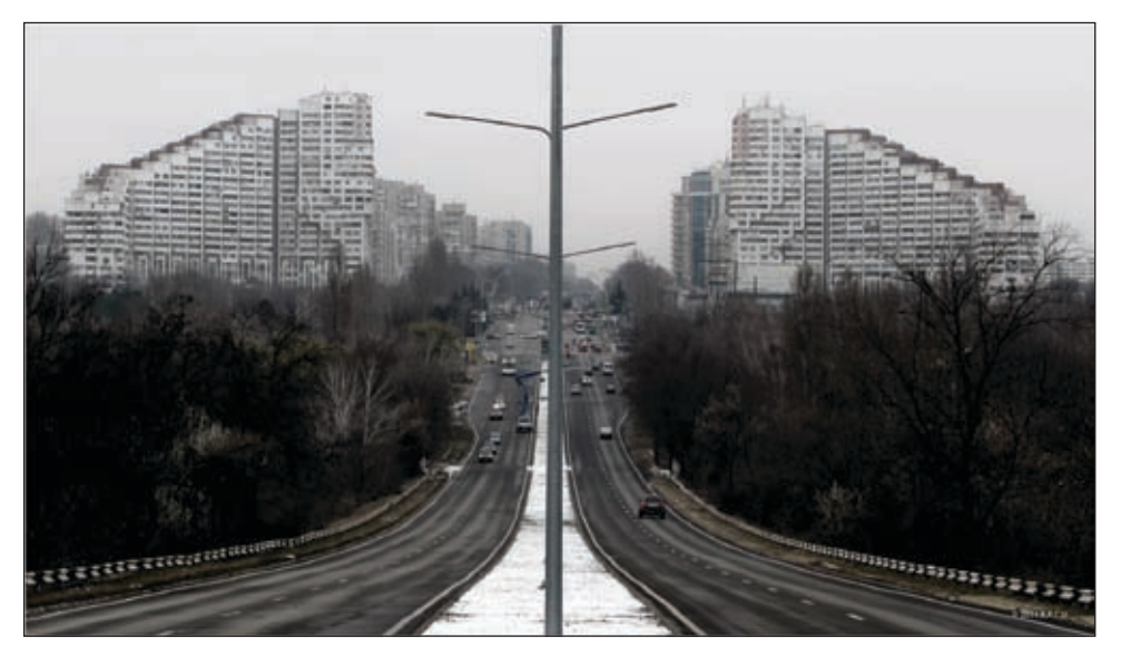
Figure 1. An illustrative image for the situation of the built environment in Chişinău, the Republic of Moldova (BACU Association Photo department, ca. 2014)

Socialist Modernism is a specific approach to architecture in former socialist countries, between 1955 and 1991, insufficiently covered by architecture history treaties. The Modernist trend was officially adopted after a historical event: in 1955, a decision of the Central Committee of the USSR Communist Party announced that "useless stylistical elements" in architecture will be abandoned. The decision followed Nikita Khrushchev's appeal, made one year before at the Union Conference of Builders, Architects and Workers in Construction Materials Industry, Construction Machines Industry, Planning and Research". From there on, Stalinist (or realist-socialist) architecture was replaced throughout the socialist bloc. In socialist countries, modernist trends first influenced the professional sphere, and through that influence, they were able to penetrate borders and the limits imposed by ideology.