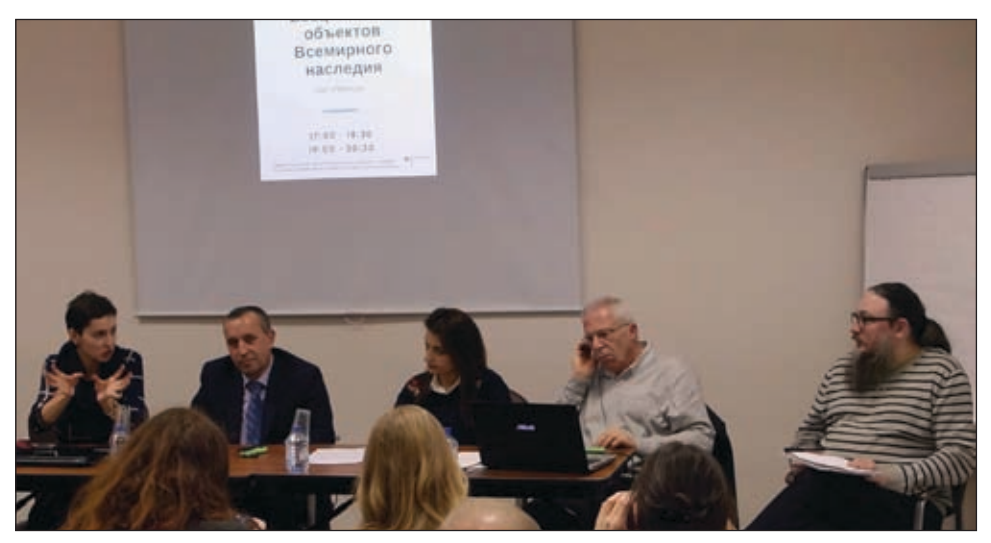
Figure 5. Public Discussion in St. Petersburg, December 2nd, 2017

dium and make a presentation. This was almost the first time when functionaries had been able to talk to the public about the efforts they were making and answer relevant questions from the audience.