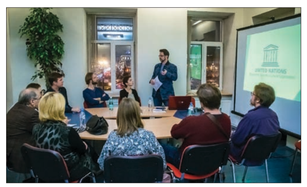
Figure 1. St. Petersburg Seminar with the tourist industry and guides, November 24th, 2017

The detailed research and description of all the components of the nomination was conducted only later and presented in the form of a small re-nomination in 2005 and later in 2009-2010. In that moment, there was an attempt to reformulate the components, to make them in a more logical and structural way, but it was unsuccessful and not accepted by the WHC. However, the more precise description and borders and the descriptions of the components were adopted that until now stay the essence of WHS, in spite of the further permanent work on the understanding of the values of all of them.