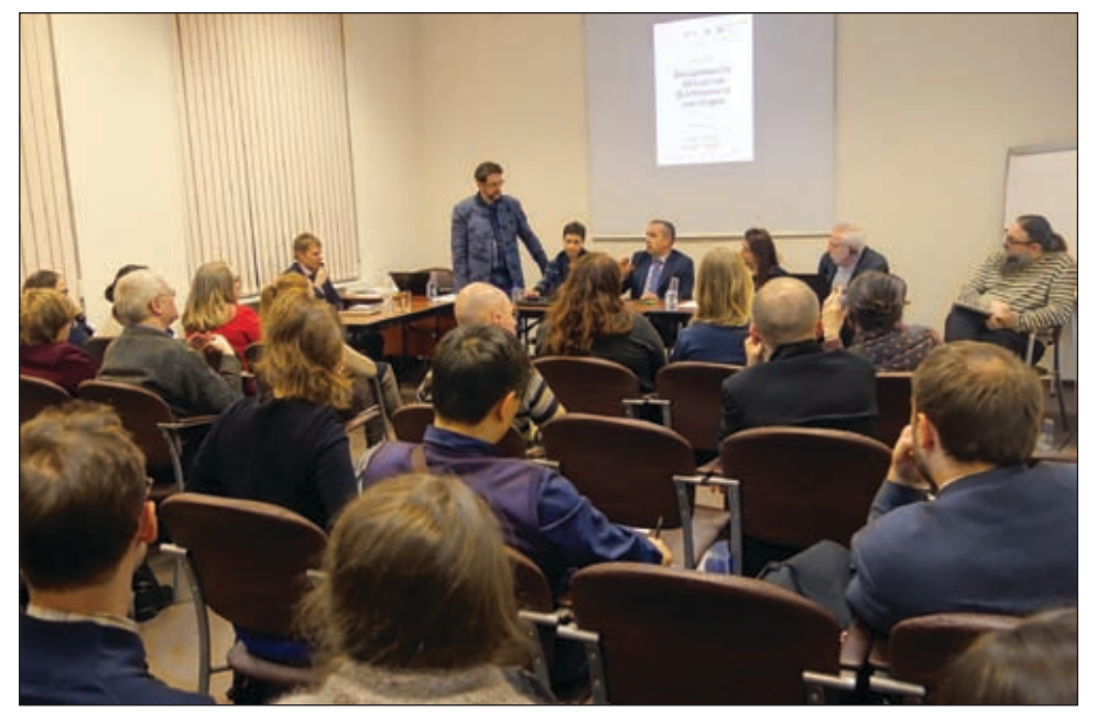
Figure 4. Public Discussion in St. Petersburg, December 2nd, 2017

St. Petersburg Seminar with the tourist industry and guides, November 24th, 2017