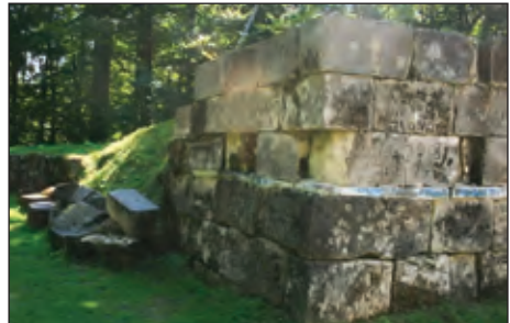
Figure 9. Sarmizegetusa Regia. Left: the pentagonal tower (2018). Right: partially ruined wall, at the west gate (2016)