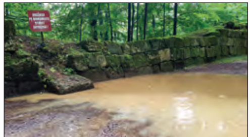
Figure 10. The impact of rains and landslides. Left: Blidaru Fortress (2017). Right: Sarmizegetusa Regia (2018)