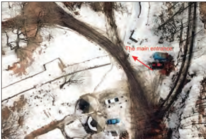
Figure 4. Sarmizegetusa Regia, forestry works done by the site administration. Top: tree felled over the fortification wall. Bottom: the entrance to the fortress impaired by the use of heavy machinery (drone photos by Agent Green, February 2018)