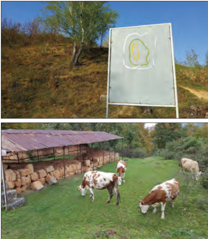
Figure 6. Costeşti–Cetăţuie Fortress. Top: the panel at the entrance to the fortress. Bottom: cows grazing within the fortress and deteriorated protection systems for the Dacian buildings