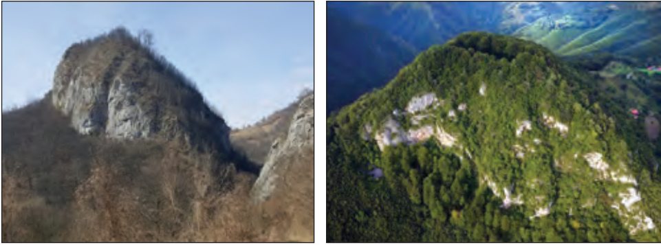
Figure 2. Bolii Hill, on top of which lies Bănița fortress (2017); Piatra Roşie Hill

War I, several digging and investigation campaigns were organized, some by the state, others at the initiative of some scholars, but all of them had to face huge difficulties because of the isolated, hard to reach the location of the sites.