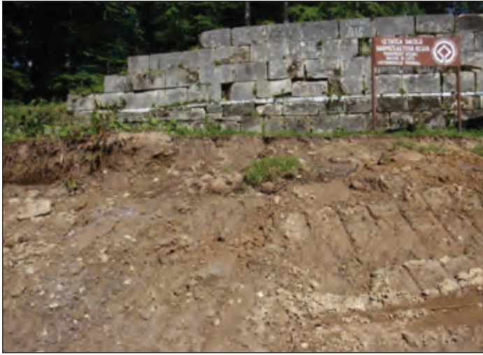
Figure 5. Sarmizegetusa Regia, unauthorized bulldozer intervention, very close to the antique wall and the main gate of the fortress.