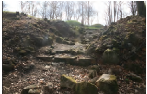
Figure 8. Piatra Roșie Fortress. Left: the only explanatory panel. Right: the main entrance to the fortress