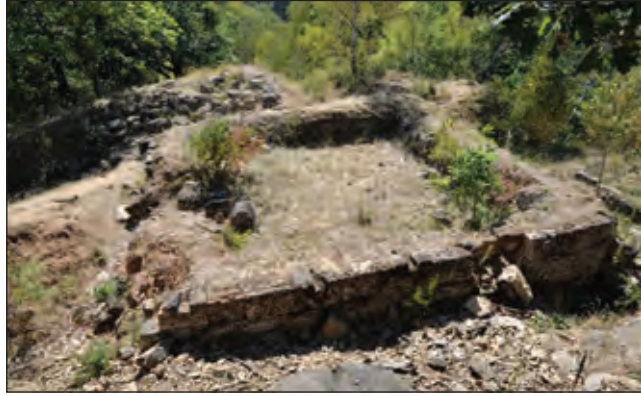
Figure 11. Căpâlna Fortress

All the elements presented in the previous chapters lead to the conclusion that the Romanian state barely managed to comply with a few of these provisions, particularly in the case of the natural sites. In the case of the Dacian fortresses of the Orăştie Mountains, the