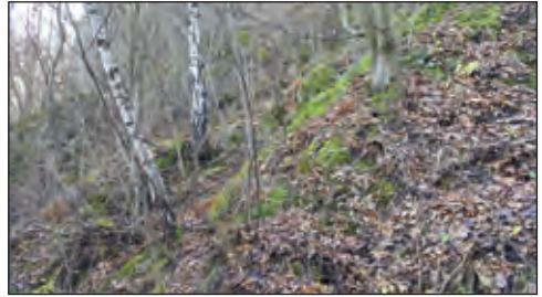
Figure 7. Bănița Fortress. Left: Entrance to the fortress. Right: the access path to the fortress