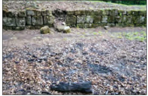
Figure 3. Vegetation burning at Sarmizegetusa Regia, affecting the monument (May 2013). Left: Antique architectonic element burned by the site administration. Right: fireplace by the western side of the fortification